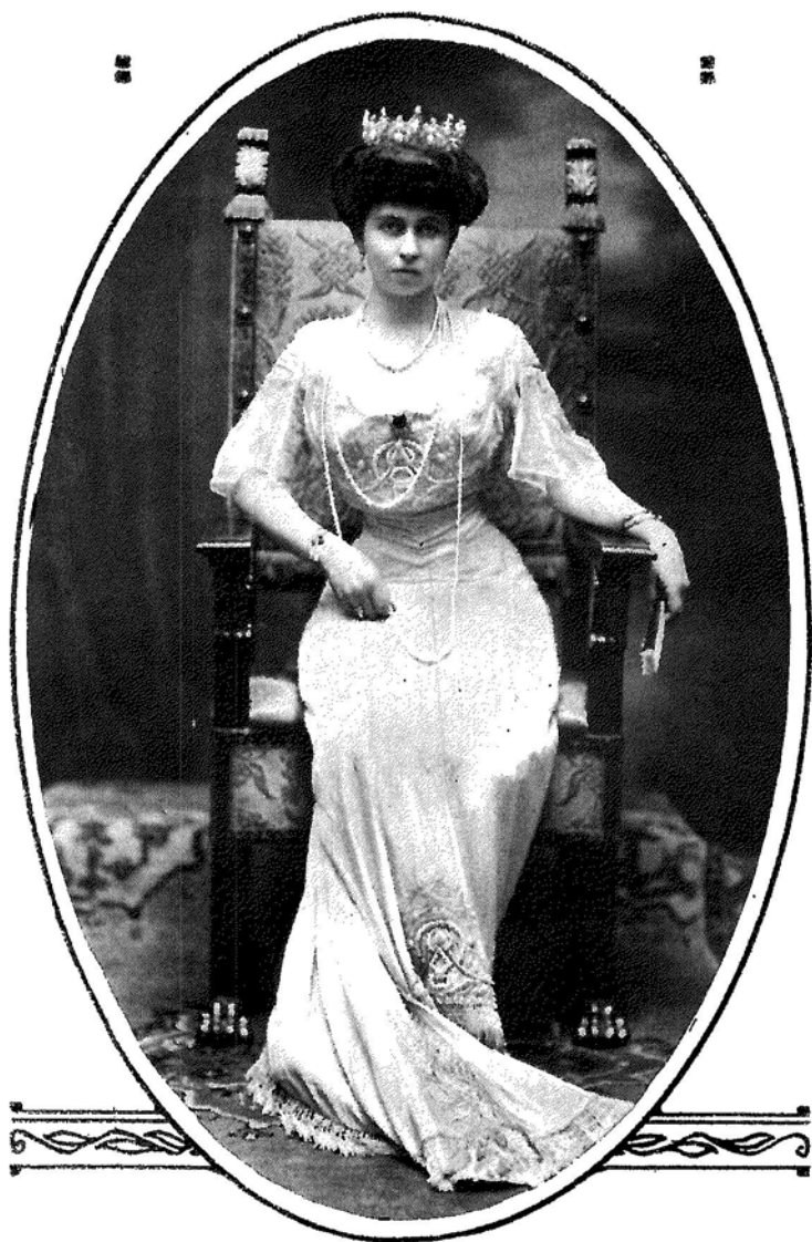
H. M. QUEEN SOPHIA OF GREECE. Sister of Kaiser Wilhelm, and an Ardent Germanophile